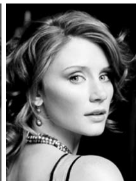
Bryce Dallas Howard